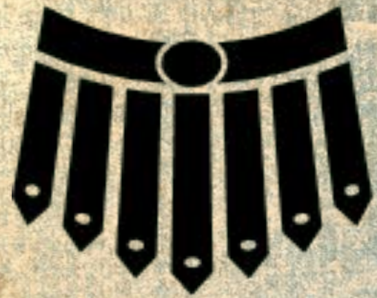
BELT OF TRUTH