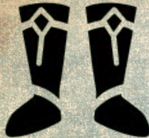
SHOES OF PEACE