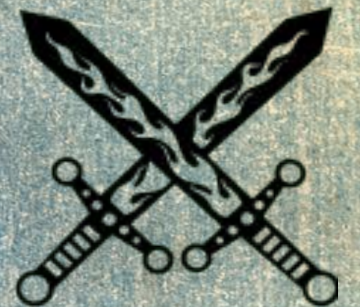
SWORD OF SPIRIT