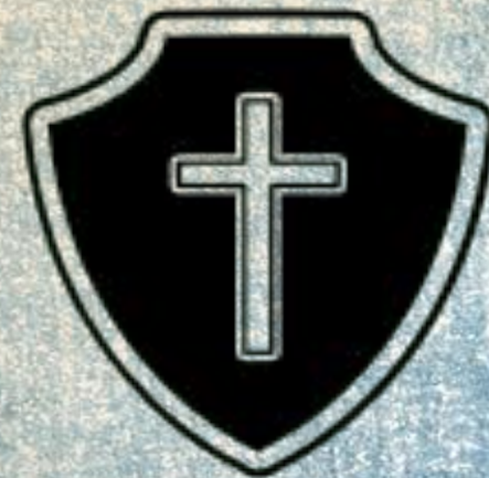
SHIELD OF FAITH