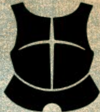
BREAST PLATE OF RIGHTEOUSNESS